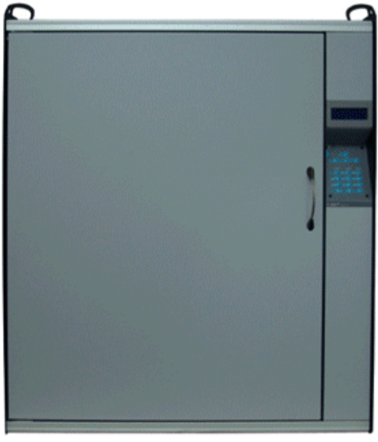
C.Q.R.iT® 100 & C.Q.R.iT® 100 expansion cabinet

Capacity: 100 key bunches H 41.9" (1047mm) W 34.3" (873mm) D 6.8" (170mm) 133lbs (60kgs)